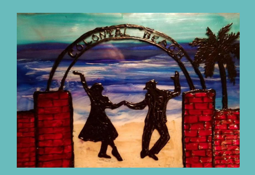
3rd Annual NNK Beach Music Festival at Town Hill September 12

The first two scheduled movies are cancelled to comply with Governor Northam's directive; subsequent dates will be evaluated as we get closer.