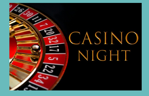
1st Annual CBCF Gala & Community Awards at Birdies October 17